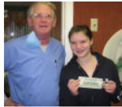
Tallahassee January winner